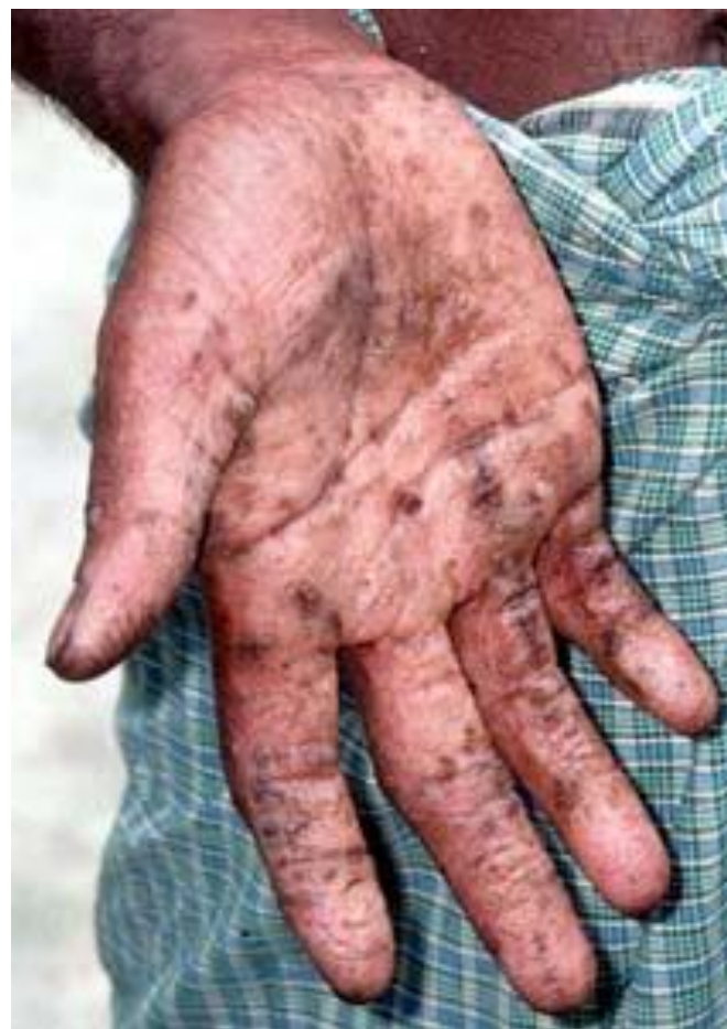
Arsenic lesions on hand